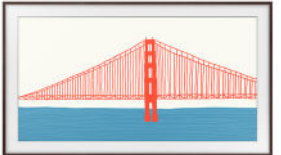
*TV not included