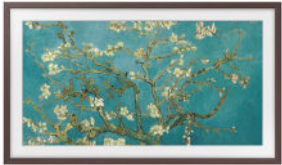
*TV not included